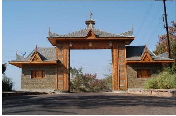
MP Tribal Museum

Bhopal is well connected to other parts of India through Air and railways, and has direct flights to Delhi, Mumbai, Hyderabad and Lucknow. IISER Bhopal campus is located about 10 kms from the airport and 18 kms from the railway station. Uber and Ola taxi service is readily available in almost all parts of Bhopal.