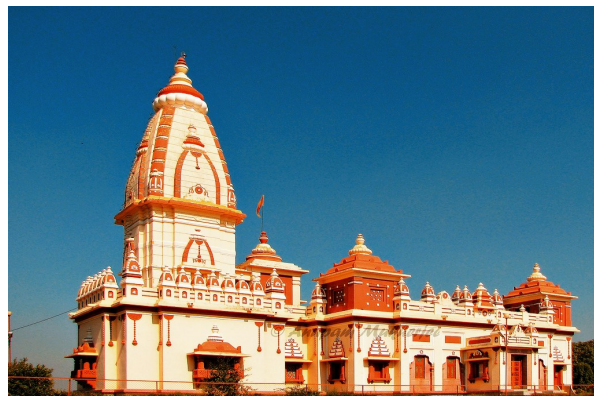
Lakshmi Narayan Temple